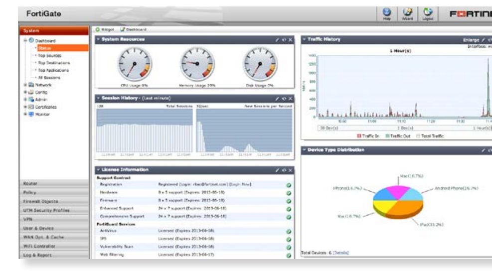
FortiOS Dashboard - Single Pane of Glass Management

Fortinet FortiGuard Subscription Services provide automated, real-time, up-to-date protection against the latest security threats. Our threat research labs are located worldwide, providing 24x7 updates when you most need it.