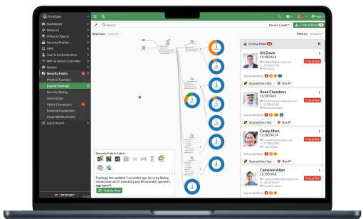
Intuitive easy to use view into the network and endpoint vulnerabilities

Learn more about what's new in FortiOS. <u>https://www.fortinet.com/products/fortigate/fortios</u>