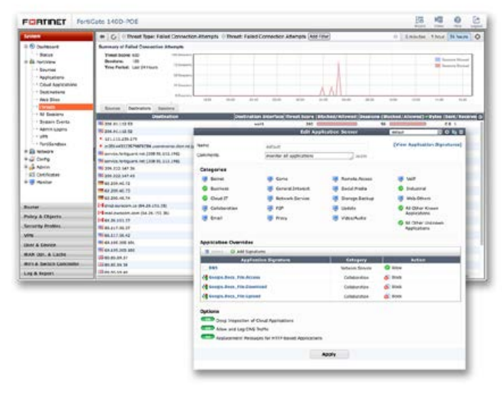
FortiOS Managment UI — FortiView and Application Control Panel